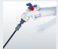
ENTRIPOINT * TROCAR SYSTEM