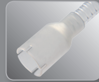
7/8 in (22 mm) Cuff Connects to most surgical smoke evacuators