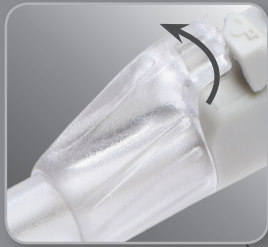
Cam Lock System Prevents telescopic capture port from moving